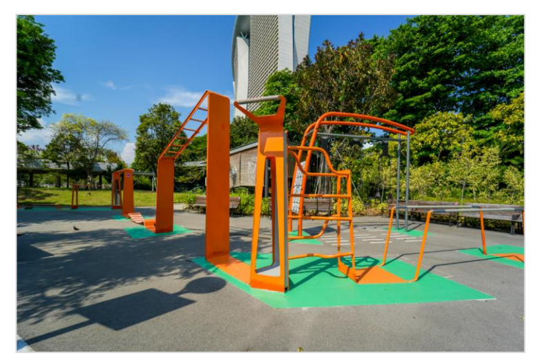
Multi-generational fitness equipment and outdoor musical instruments suitable for visitors of all ages, whether for exercise or for general play.

The community garden grows more than 50 types of vegetables, herbs and fruits, from starfruit and long beans to less common edibles like Noni and Bilimbi, and is maintained by 20 Gardens by the Bay volunteers. Horticulturists and volunteers make use of the community garden as a practical example during edibles-themed workshops.